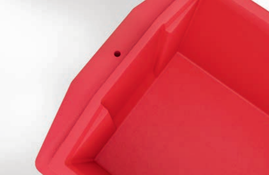
Recessed groove for easy removal