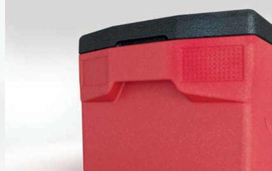
4 label fields and ergonomic handles