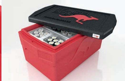
Suitable for Gastronorm containers